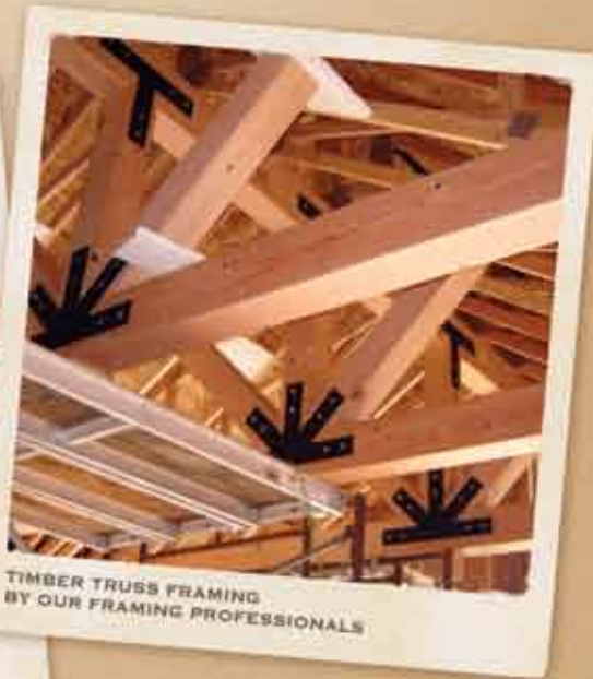
TIMBER TRUSS FRAMING BY OUR FRAMING PROFESSIONALS