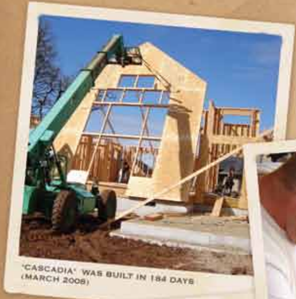
'CASCADIA' WAS BUILT IN 184 DAYS (MARCH 2008)