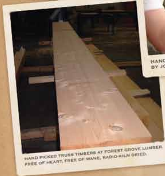
HAND PICKED TRUSS TIMBERS AT FOREST GROVE LUMBER. FREE OF HEART, FREE OF WANE, RADIO-KILN DRIED.